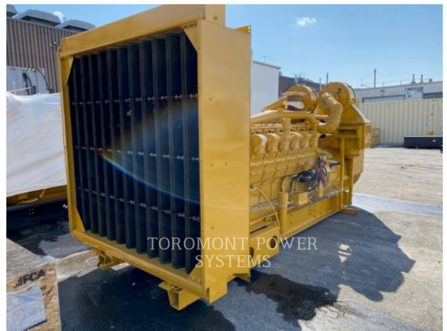
TOROMONT POWER SYSTEMS