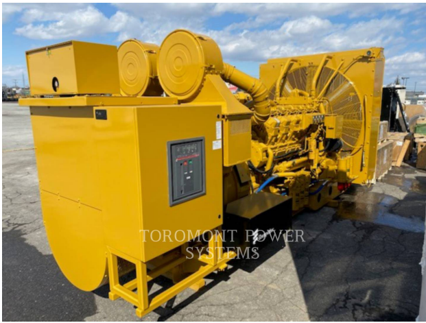
TOROMONT POWER SYSTEMS