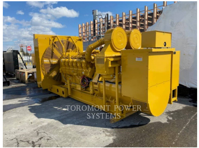
TOROMONT POWER SYSTEMS