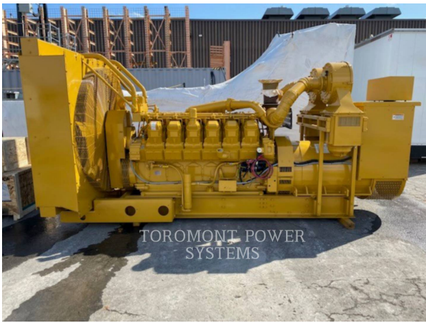
TOROMONT POWER SYSTEMS