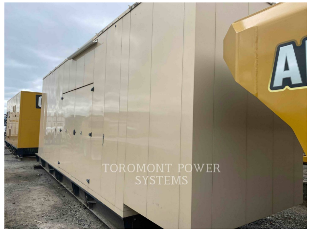
TOROMONT POWER SYSTEMS