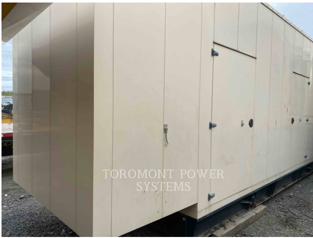
TOROMONT POWER SYSTEMS