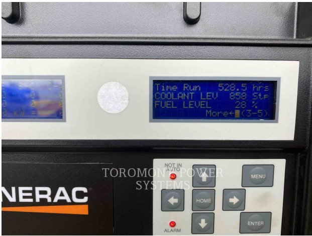
TOROMONT POWER SYSTEMS