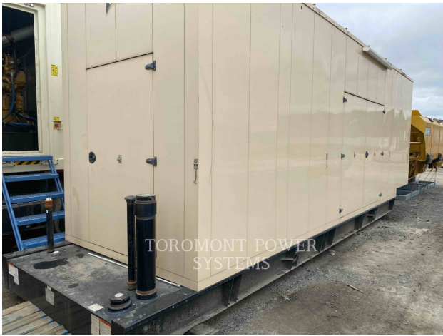
TOROMONT POWER SYSTEMS