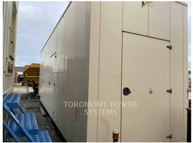
TOROMONT POWER SYSTEMS