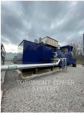
TOROMONT POWER SYSTEMS