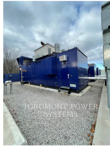
TOROMONT POWER SYSTEMS