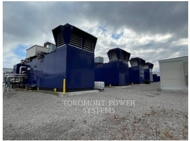
TOROMONT POWER SYSTEMS