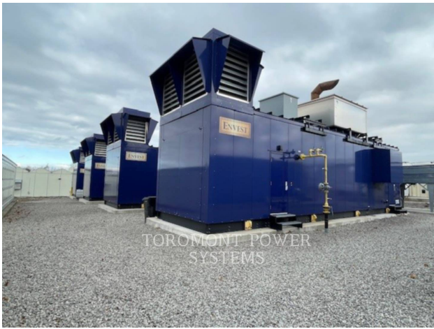
TOROMONT POWER SYSTEMS