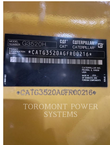
TOROMONT POWER SYSTEMS